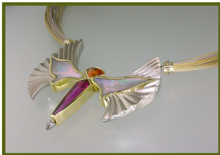
“Messenger” takes flight in this interCHANGE ® clasp! Rubellite tourmaline and spessartite garnet body, book-matched boulder opal feathered wings caught in a blur of motion of white gold accented with diamonds