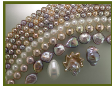
Intense colours & fanciful shapes found in freshwater pearls

Pearls are not limited to formal wear; you may also wear a strand or a pair of earrings with jeans and a T-shirt. Every skin tone is flattered by certain colours of pearls. It is important to try on a variety of pearls to discover the perfect complement to your complexion. Jewels by Design carries a wide selection of pearls and we will be happy to help you make the best choice.