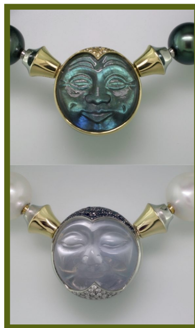
“Janus” double-sided pendant set with carved spectrolite face on one side, Moonstone face on the reverse accented with black, yellow and white diamonds