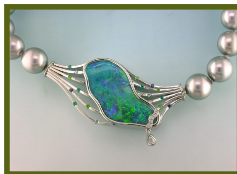
“Weep not for Atlantis” interCHANGE ® clasp set with magnificent blue-green black opal, complementary accent gemstones

Many of our clients have purchased and built a wardrobe of jewellery pieces that incorporate our interCHANGE ® clasp system. The interCHANGE ® advantage is that you can continue to add new components to provide even more versatility. Start with a basic chain or strand of pearls and add a decorative centerpiece to dress it up.