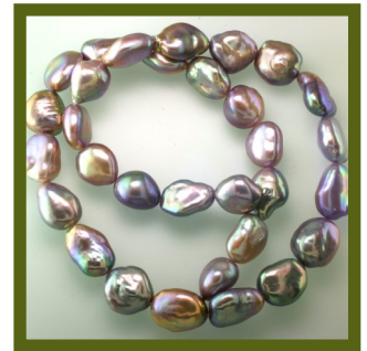
Intense, metallic multi-colour baroque freshwater pearls

Australia's clear silvery whites or rich creams and golds from Indonesia and Burma. The waters of Tahiti and the Cook Islands give us silvers burnished by turquoise or pistachio and darker greys and blacks overlaid with rainbow hues reflecting all the colours of the spectrum.