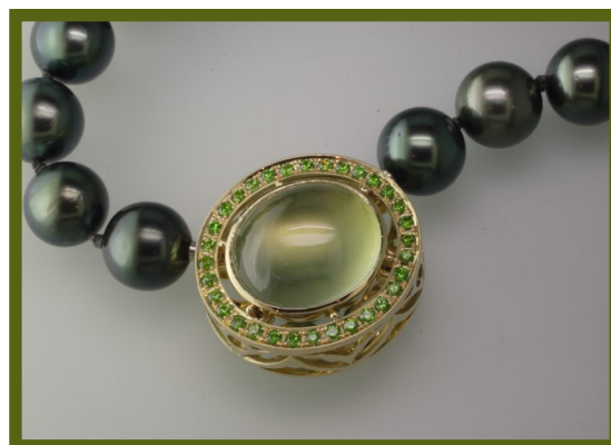
“Spring Dance” interCHANGE ® clasp set with prehnite cabachon surrounded by brilliant demantoid garnets