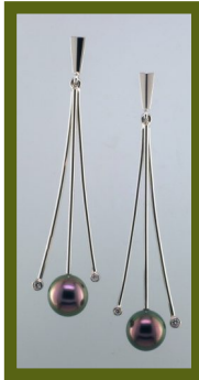
Peacock-black south sea pearl and diamond drop earrings