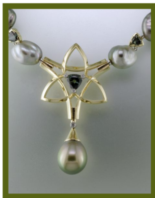
“Penumbra” interCHANGE ® clasp set with green sapphire and diamond with drop pearl accent

We have been busy creating new and beautiful pieces (see some of them on this page) and we invite you to visit the shop and see them in person. Some of these new clasps are made to allow the attachment of an additional drop pendant to further enhance the clasp.