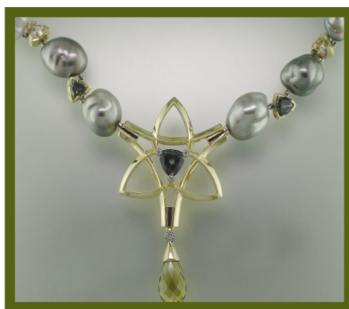
“Penumbra” clasp with alternate Mali garnet drop