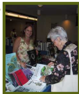
Stocking up on jewellery books!

Jewellery Camp is unique in the world. Nowhere else do you gather a group with this degree of combined scholarship, talent and experience who are yet so approachable and generous in sharing their gifts.