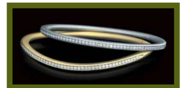
Diamond bangles by Pascal Lacroix