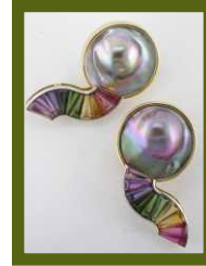
Rainbow Tails: Earrings Mabe Pearls and multi-coloured gemstones

At Jewels by Design, our special focus is the creation of jewellery using the full palate of coloured gemstones. This newsletter shares thoughts on colour psychology, dramatically illustrated by our gemstone colour wheel inside.