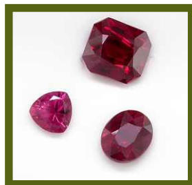
Three superb Rubies showing the colour range 0.50 carat - 2.0 carats

"Rubies are Red..." as all other colours of corundum are called Sapphires. In the Orient they were thought to contain the 'spark of life' like a drop of heart's blood. They were believed to be self-luminous, being so bright they could illuminate a room at night. Ruby's virtues included the ability to resist poison and sadness, restrain lust, drive away frightful dreams, keep the body safe and signify imminent mischance by appearing to darken in colour.