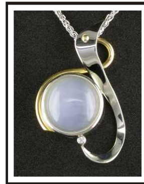
Moonstone Pendant in 2-Tone Gold with Diamond

Other white or clear gems available at Jewels by Design include Agate, Jade, Rock Crystal & Fossil Ivory.