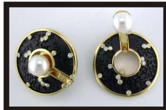
Carved Black Onyx and Diamond convertible earring jackets with White Akoya Pearls

It is satisfying to design black gemstone jewellery. Some gems available in black and featured in Jewels by Design creations include Black Diamonds, Jade, Onyx, Pearl, Jet, Star Sapphire, Agate, Granite, and Hematite. These stones may have matte, textured or mirror polished finishes sometimes in combination. They are perfect for daytime and for the desired nuance of a special evening.