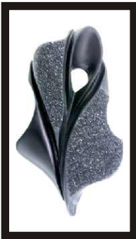
Druzy Black Onyx carved by Steve Walters

and white are chosen to set off other colours, as they enhance and extend all colours without stealing the scene. In our wardrobe they can each have either supporting roles or star power.