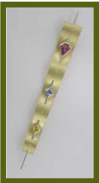
Brooch with Red Spinel, Blue & Yellow Sapphire

YELLOW reflects the life-sustaining sun, intellect and enlightenment. It is an uplifting colour and a preference for it implies introspection and a logical mind. Lovers of yellow think things through with great care and conviction and are attracted to contemporary, challenging concepts.