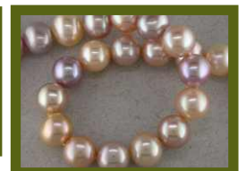
Gorgeous strand of natural multi-colour Chinese Freshwater Pearls.