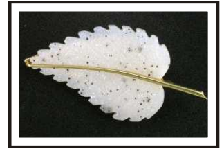
Carved Druzy Agate Leaf Brooch

WHITE suggests purity, innocence, freshness, clarity and elegance. We all have a palette of white that is flattering to us. White has the most variation in its tones and shades and can be as soft as snow, as brilliant as daylight, as crisp as lace, as lush as Devonshire cream. White radiates back the full colour spectrum giving us energy, optimism, a new start.