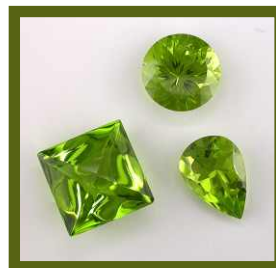
Fine Peridot in a variety of shapes 2.0 - 6.0 carats